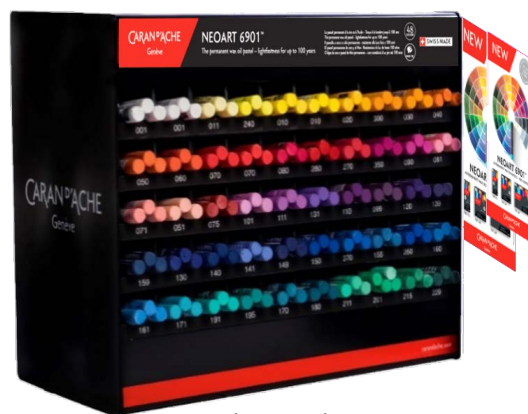
Display stand PR7901.299 + Content 7901.299